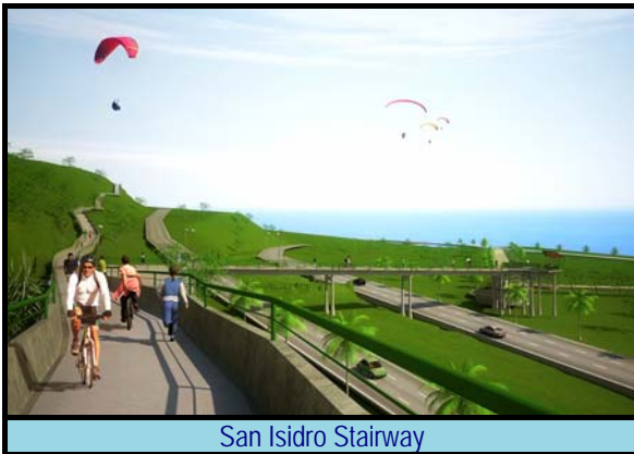
San Isidro Stairway

A small square will be constructed at each beach access point housing public washrooms, benches, litter bins, bicycle parks and additional urban furniture.